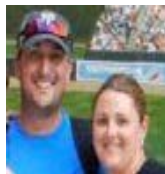
Malgradi & Voak